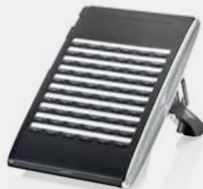
60-line DSS Console