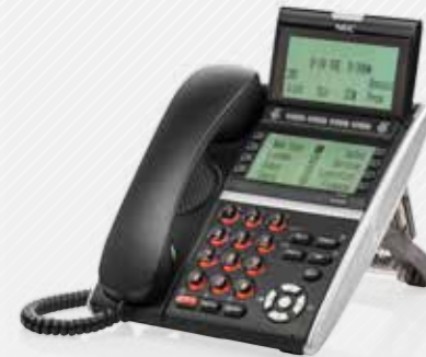
DT430 & DT830 Dual Display (Desi-less)