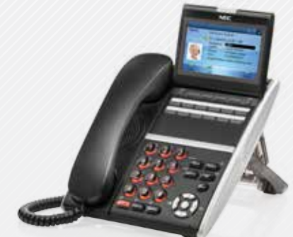
DT830CG Color Display