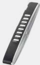
8-line Key Module