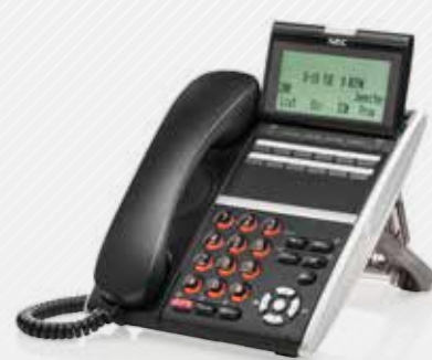
DT430 & DT830